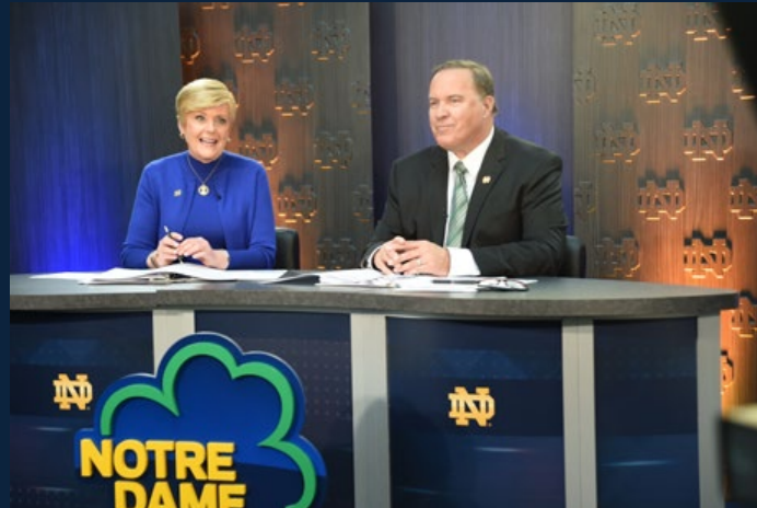
29 HOUR BROADCAST